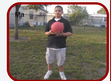
Getting Ready to Play Some Ball