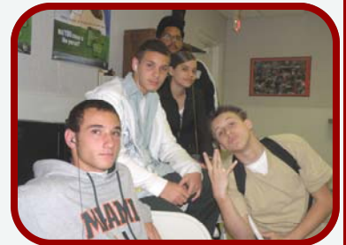
Firewall Students Hanging Out

All of this is evidence that God not only was not through with Firewall Ministries, but has a huge plan for us to continue touching young lives through mentoring and discipling every day. Throughout the last