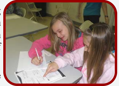
Helping Each Other with Homework

We now have three centers with more on the way and we plan on having tours at all of them! At these 50-minute tours, you will have the opportunity to see, hear, and feel what we do on a daily basis to impact young lives. These tours will be offered at different times and locations starting on the week of August 30th. Please contact us to schedule your visit.