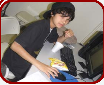
Doing Some Computer Homework

couple of months we have sat down with many pastors and other community leaders to discuss the impact of opening a Firewall Center in their neighborhood. We have been amazed at how incredibly receptive everyone has been to our ministry. They all see the need to reach out to young lives at such a critical point in their development. We are thrilled that God has chosen Firewall Ministries to become an ever-growing presence in South Florida and beyond, changing the way after-school ministry is done.