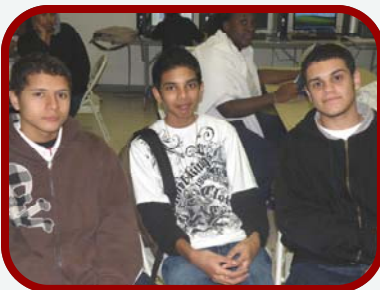
Ready for Assembly