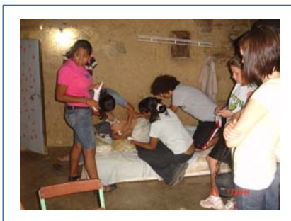
Cleaning a sick person that is confined to his mood house. Siervos de Valor Ministry in El Tocuyo.