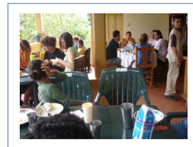
Having breakfast at the ABANSA Foster House in Barquisimeto.

We at Calvary Chapel Sawgrass are part of God's work at those ministries; our offerings have become a testimony of God's faithfulness and unlimited provision for his beloved children.