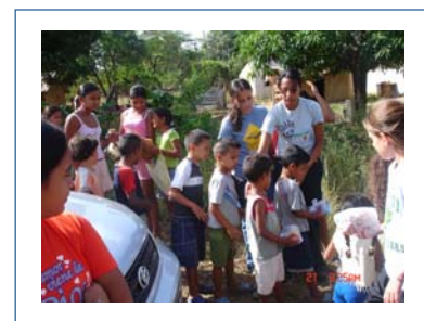
Distributing school supplies in poor neighborhoods in El Tocuyo